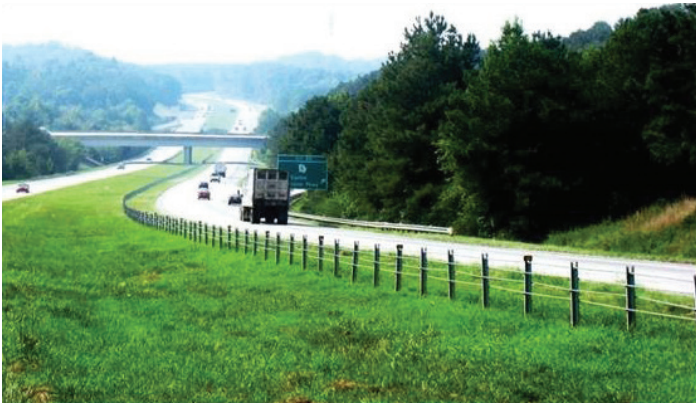
Figure 3. An Example of HTCB Median Barrier