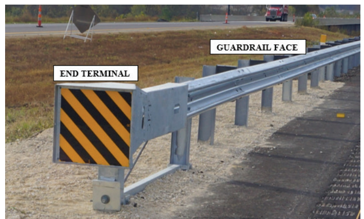
Figure 5. A Roadside Guardrail

Median barriers reduce the number of crossover crashes and severe-injury or fatal crashes. One major consideration about median barriers is the width of the median and knowing where and what type of barrier should be installed. The common median width for installing cable barriers is 40 feet to 75 feet. A few other factors to consider include the median slope, the amount of traffic, the crash history, and the cost. HTCBs are in wide use across the country and are seen as more effective than low-tension cable barriers. Figure 3 shows an installation of HTCB as a median barrier. HTCB can be placed on slopes as steep as 4:1 or flatter. It should be noticed that the HTCB can also be used as a roadside barrier. Figure 4 shows a roadside barrier using HTCB in Idaho. For more details on HTCB median warrants, readers are encouraged to refer to a technical memorandum published by the Minnesota Department of Transportation in 2015 (2).