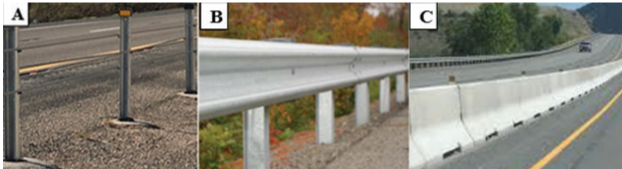
Figure 2. Types of Median Barriers: a. Flexible; b. Semirigid; c. Rigid

Table 1 lists several CMFs pertinent to median barriers and roadside guardrails in the CMF Clearinghouse database . They are applicable to principal arterials as well as other freeways and expressways where roadside guardrails and median barriers are deployed. All the CMFs in Table 1 are less than one, which indicates a decrease in fatal and serious-injury crashes by the installation of guardrails and median barriers. Guardrails are effective in reducing fatal and serious-injury crashes, ranging from 16 to 47 percent in reducing such crashes. Median barriers are very effective in reducing cross-median crashes (expected 52 percent reduction in all fatal crashes and 61 percent reduction in all serious-injury crashes). All the CMFs for guardrail and median barriers in Table 1 have a Star Quality Rating of three or more, which means the results of the study producing the CMF are in good quality (five stars is the highest rating) (1).