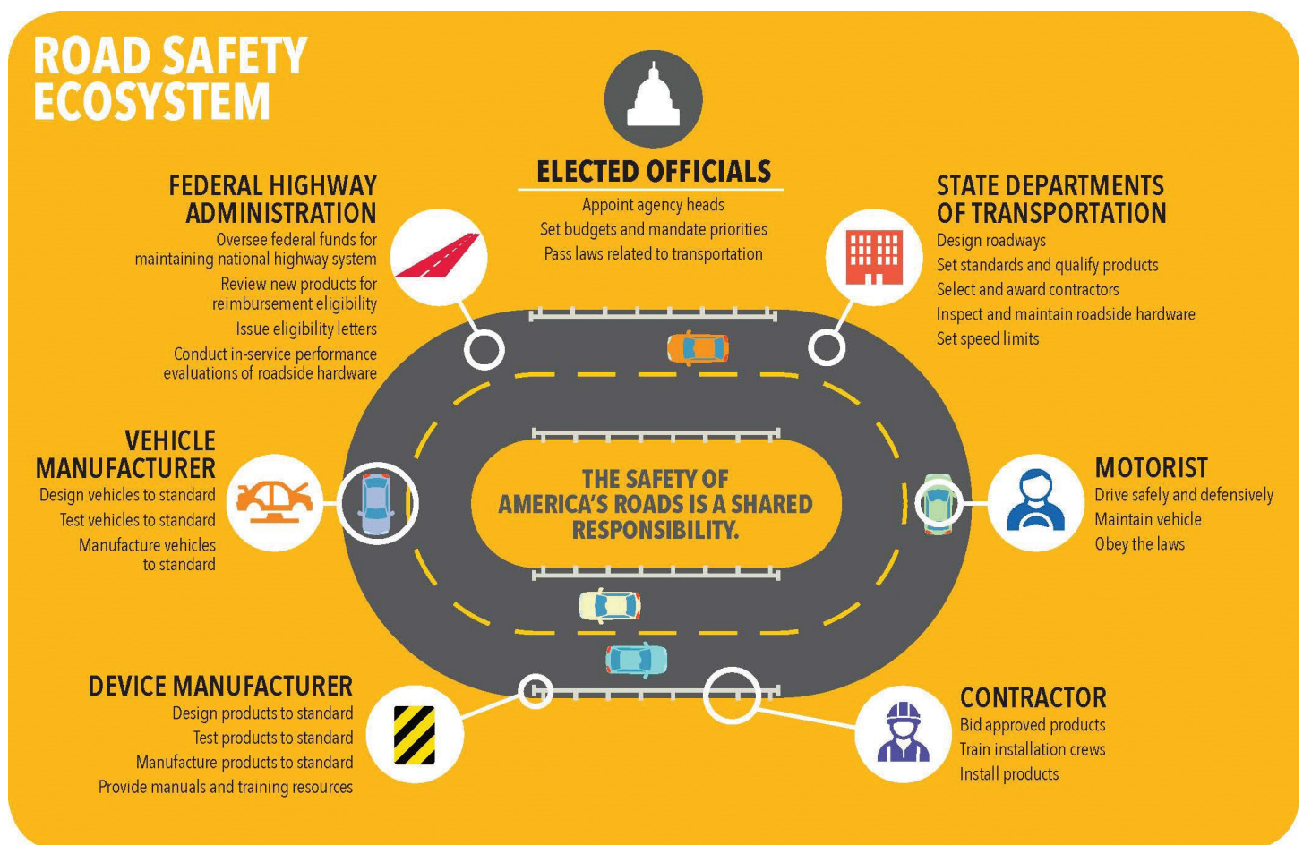
Figure 1. Road Safety Ecosystem

Their efficacy in mitigating crash severity is assessed by a crash modification factor (CMF), an estimate of the change in crashes expected after implementing a given countermeasure at a specific site. A CMF reflects the safety effect of a countermeasure, whether it is a decrease in crashes (CMF less than 1.0), increase in crashes (CMF more than 1.0), or no change in crashes (CMF of 1.0) (1). For example, in Table 1, CMF of median barrier for preventing cross-median fatal injury crashes is 0.34. This means, the expected number of fatal crashes after installation of median barrier will be reduced by approximately 66 percent.