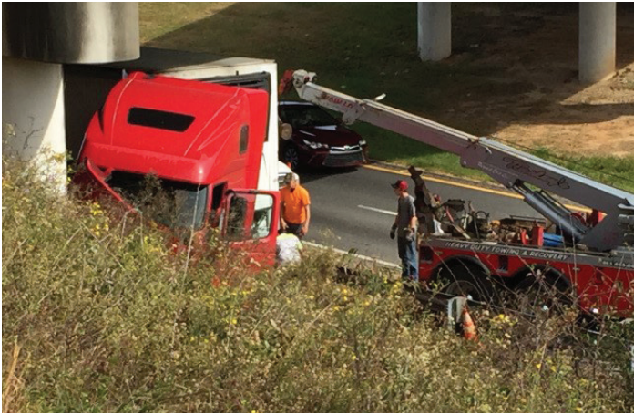
Figure 12. Tractor-Trailer Crash With a Guardrail on I-85 in Oconee County, S.C. (11)