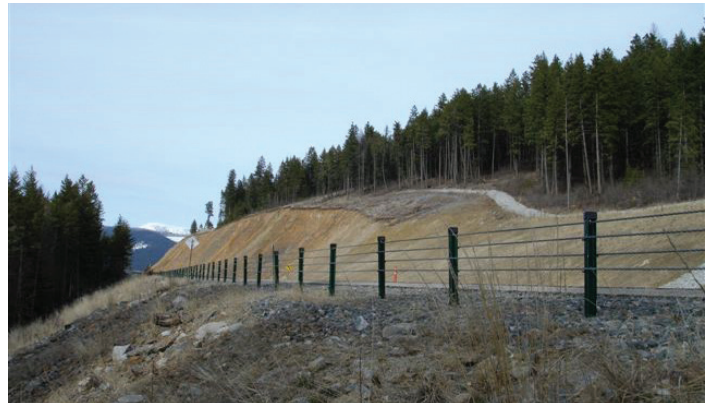
Figure 4. An Example of HTCB Roadside Barrier