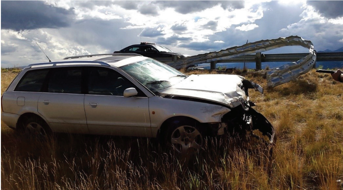
Figure 11. Mr. Ben Tandberg's Car After Colliding With a Guardrail Terminal in Montana

Guardrails have been in use for a long time as a part of almost every highway. Guardrails are a hazard of some magnitude and should be used only when necessary. In the past, some guardrails have been placed improperly and used in a manner that prevented them from performing as intended. Such incidents have created a slight prejudice against guardrails among the general public. As an attempt to remove any misconceptions, here are three of numerous stories that illustrate the life-saving qualities of guardrails.